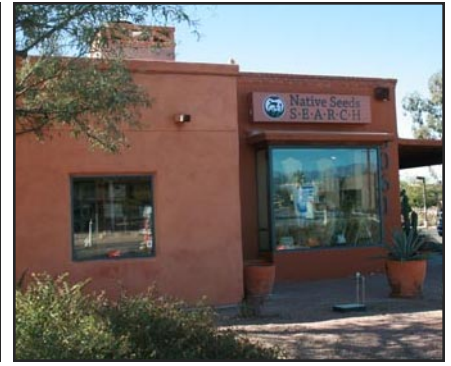
clockwise from top left The new Agricultural Conservation Center. Mole demonstration with Amy Valdes Schwemm of Mano y Metate. The new NS/S store on Campbell Avenue. Rio Mayo Segualca squash. The 2010 Volunteer Appreciation Breakfast.